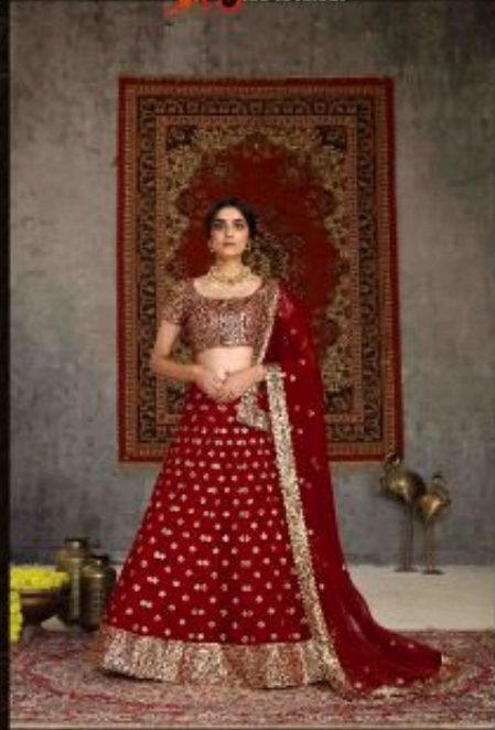
Design No. 123