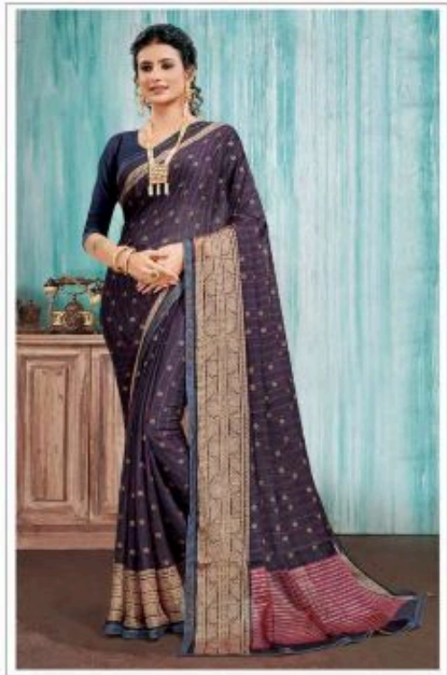
TRUE STYLE IS NOT ABOUT HAVING A DRESS FULL OF EXTENSIVE AND HAUTEUT, THROUGH TO BEING ABOUT KNOWING WHEN, WHERE, AND HOW TO WEAR YOUR COLLECTION.