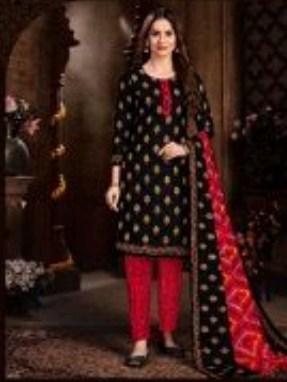
• 2001 •