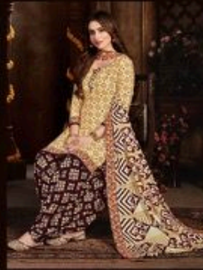
• 2005 •