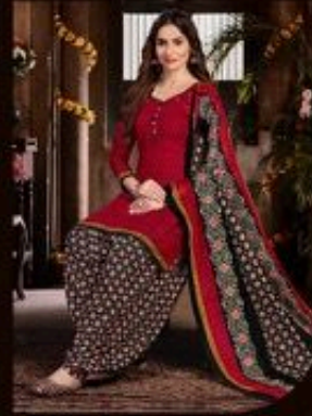
• 2008 •