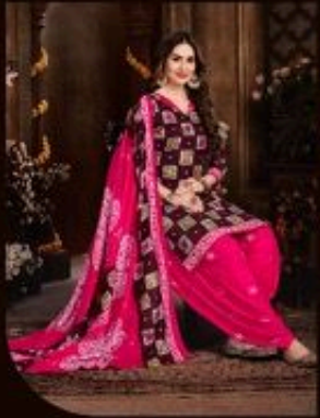
• 2004 •