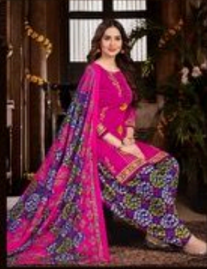
• 2002 •