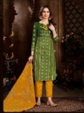
• 2003 •