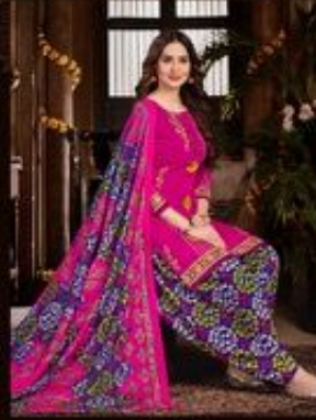
• 2002 •