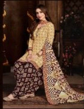
• 2005 •