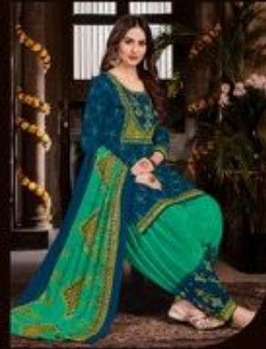
• 2006 •