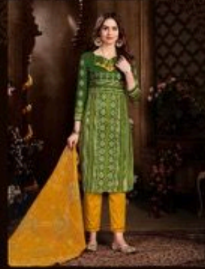
• 2003 •