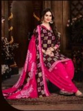
• 2004 •