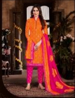
• 2007 •