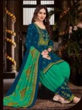
• 2006 •