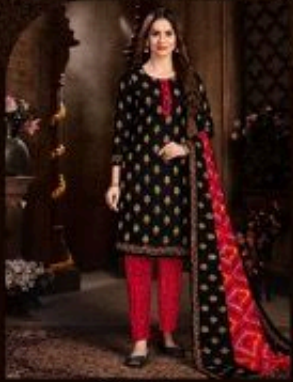
• 2001 •