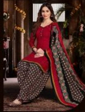
• 2008 •