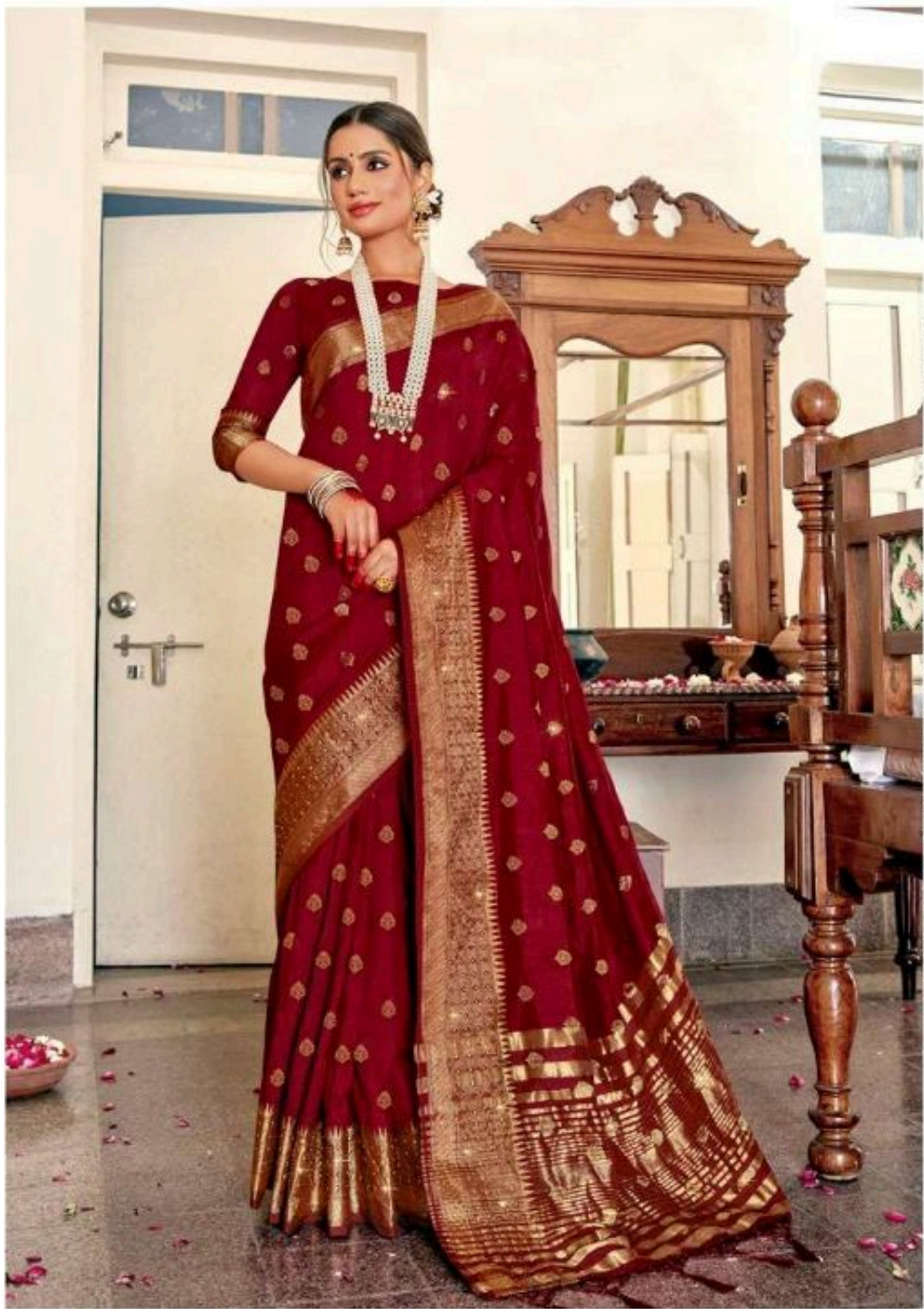
This design is protected under the designs act and any other unauthorised form of reproduction shall attract legal action.