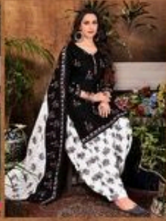
» 1006 »