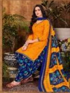
» 1009 »