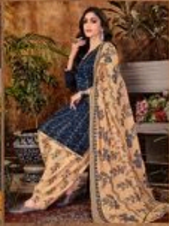
» 1010 »