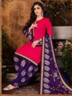
» 1008 »