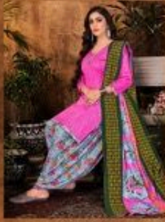
» 1005 »