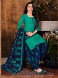
» 1004 »