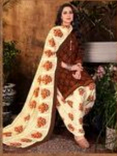
» 1007 »