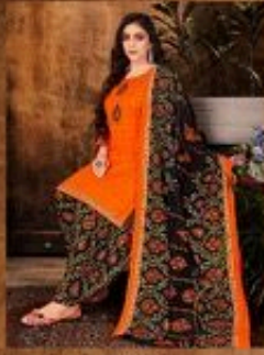
» 1001 »