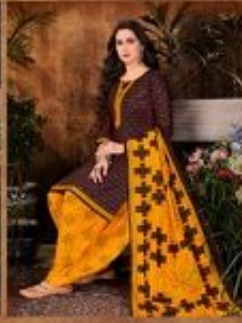
» 1002 »