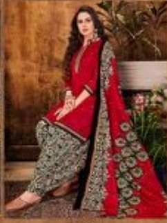
» 1003 »