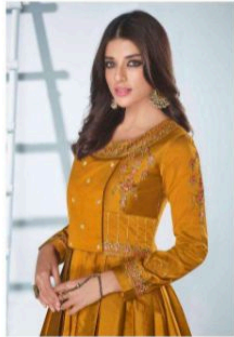
301007 This is a beautiful and classic dress for any occasion. It is made of high quality fabric and is available in various colors and sizes.