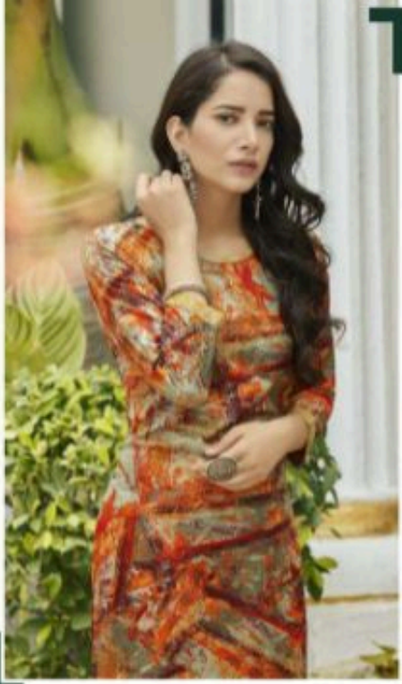
Simplicity in the ultimate form of complexity = 12529 =