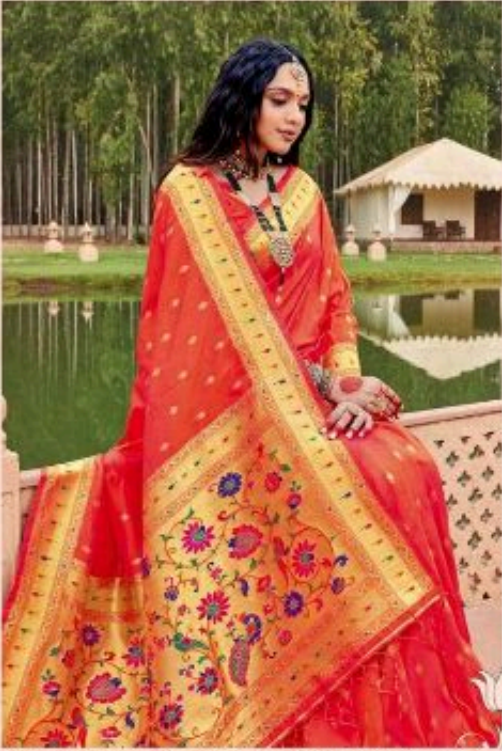
Right fabric, design, texture and handcrafted with a touch of shimmering in all events, women are happy.