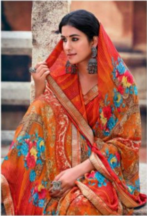
for modelling and styling by Anup Sarkar