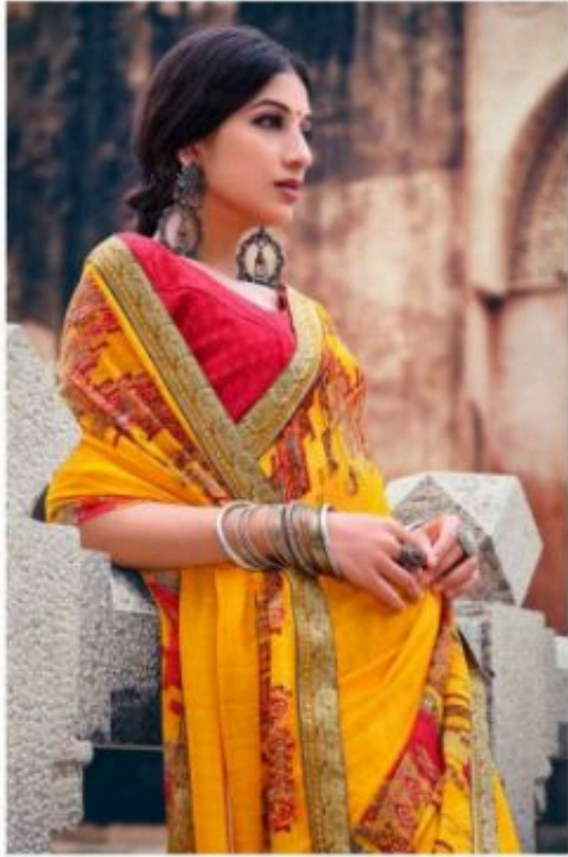
Blouse collection because you are one of a kind. Being colorful, lively and dignified, our creative designs go with a natural look.