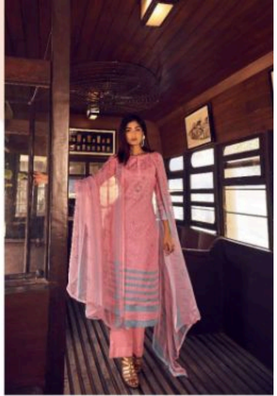
This is being worn daily yourself in the train. This is being worn daily yourself in the train.