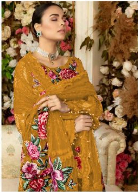
TOP - BUTTERFLY NET EMBROIDERED WITH PATCH INNER BOTTOM - HEAVY SANTOON SILK DUPATTA - BUTTERFLY NET EMBROIDERED