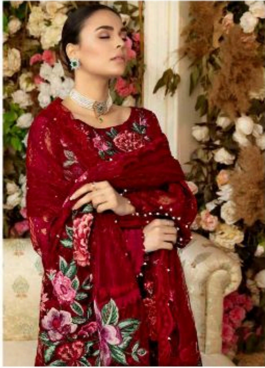
TOP - BUTTERFLY NET EMBROIDERED WITH PATCH INNER BOTTOM - HEAVY SANTOON SILK DUPATTA - BUTTERFLY NET EMBROIDERED