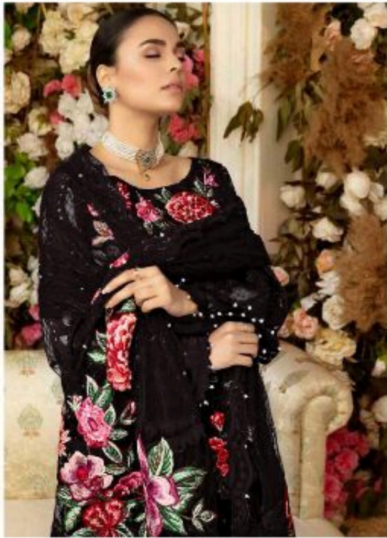
TOP - BUTTERFLY NET EMBROIDERED WITH PATCH INNER BOTTOM - HEAVY SANTOON SILK DUPATTA - BUTTERFLY NET EMBROIDERED