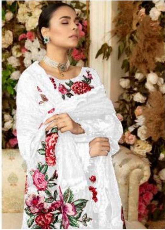
TOP - BUTTERFLY NET EMBROIDERED WITH PATCH INNER BOTTOM - HEAVY SANTOON SILK DUPATTA - BUTTERFLY NET EMBROIDERED