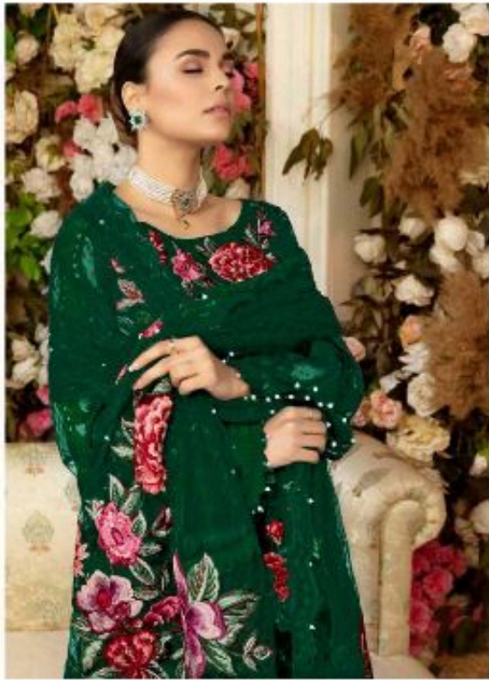
TOP - BUTTERFLY NET EMBROIDERED WITH PATCH INNER BOTTOM - HEAVY SANTOON SILK DUPATTA - BUTTERFLY NET EMBROIDERED