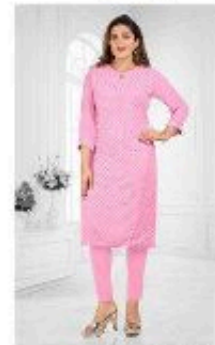
... 104 ...