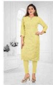
... 102 ...