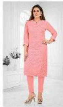
... 101 ...