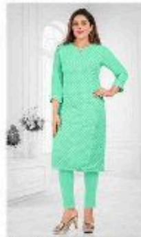
... 103 ...