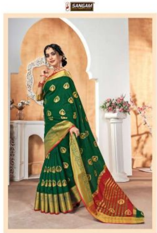
The quality of the saree is 100% guaranteed to be a perfect fit for you. 100%