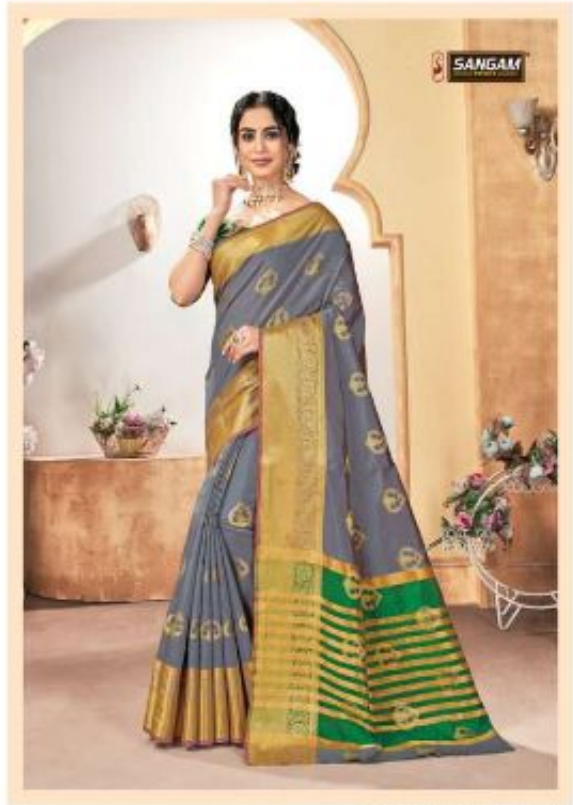
Choose your style and wear it with the confidence and grace. 1208