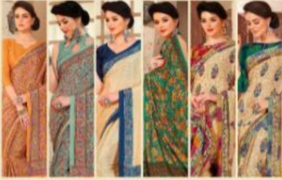
6100A 6100B 6100C 6100E 6100A 6100K