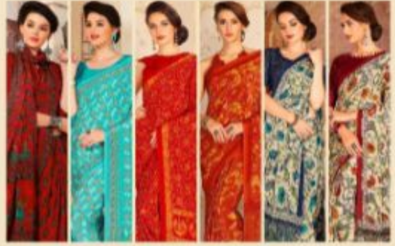
6100A 6100E 7100D 7100E 7100A 7100B