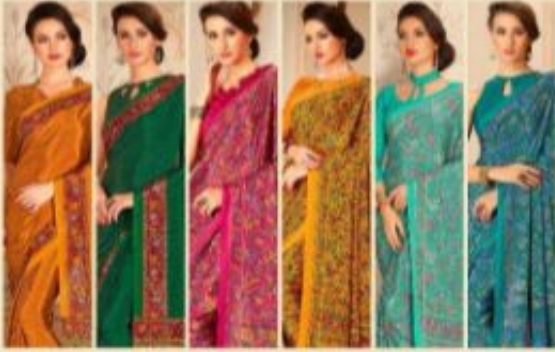
7100A 7100B 7100A 7100E 7100A 7100A