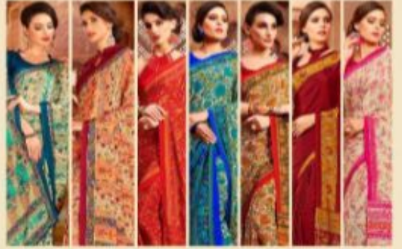
7100A 7100E 6001C 6001A 6001B 6001C 6001C