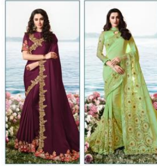
◆ 6213 ◆