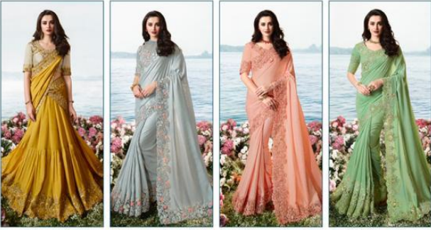
◆ 6205 ◆