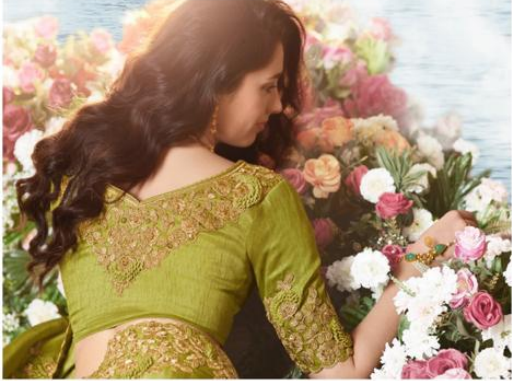
You are undoubtedly the magnificence of her for with these magnetic, shades and pink combination embellished with delicate work details.