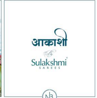
◆ 6214 ◆