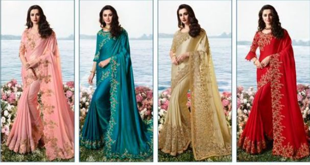
◆ 6201 ◆