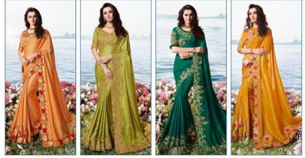
◆ 6209 ◆