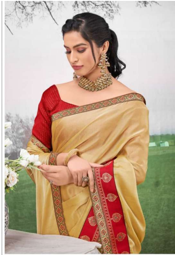
FLOWER CHILD THE CLASSIC PINKISH FLORA IS THE PRIDE OF THE RANGE. BUT THE SERIES IS COMING WITH THE EXCLUSIVE AND LIGHT BEAUTY TO MAKE YOU FEEL LIKE A FLOWER CHILD.