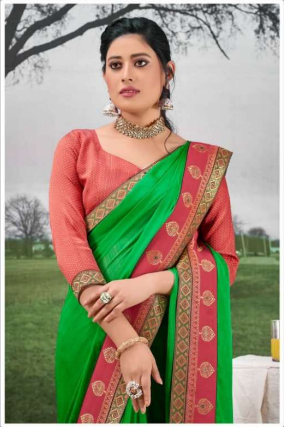
A CONTEMPORARY DRESS WITH CONVENTIONAL DESIGN WOULD KEEP FRESHNESS AND STYLING CLARITY TO THE LOOK