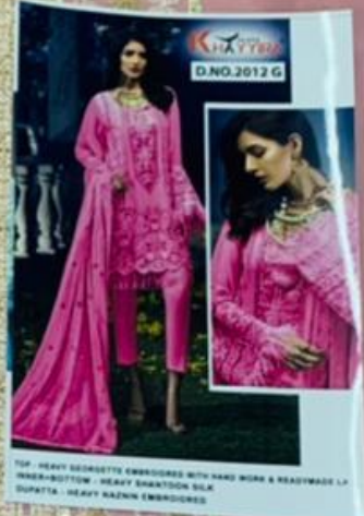
TOP - HEAVY SIKHNETTA EMBROIDERED WITH HAND WORK & READYMADE LK INNER-BOTTOM - HEAVY SIKHNETTA SILK DUPATTA - HEAVY NAJMIN EMBROIDERED