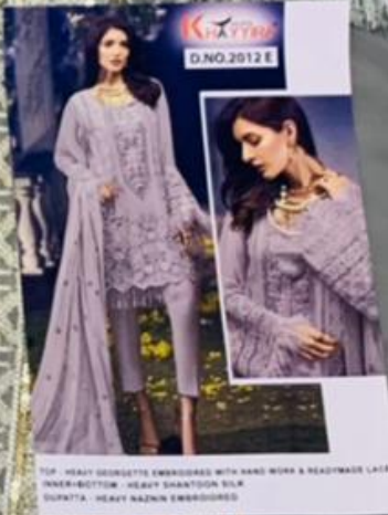
TOP - HEAVY GEORGETTE EMBROIDERED WITH HAND WORK & READYMADE LACE INNER-BOTTOM - HEAVY SHANTOON SILK DUPATTA - HEAVY NAJIN EMBROIDERED