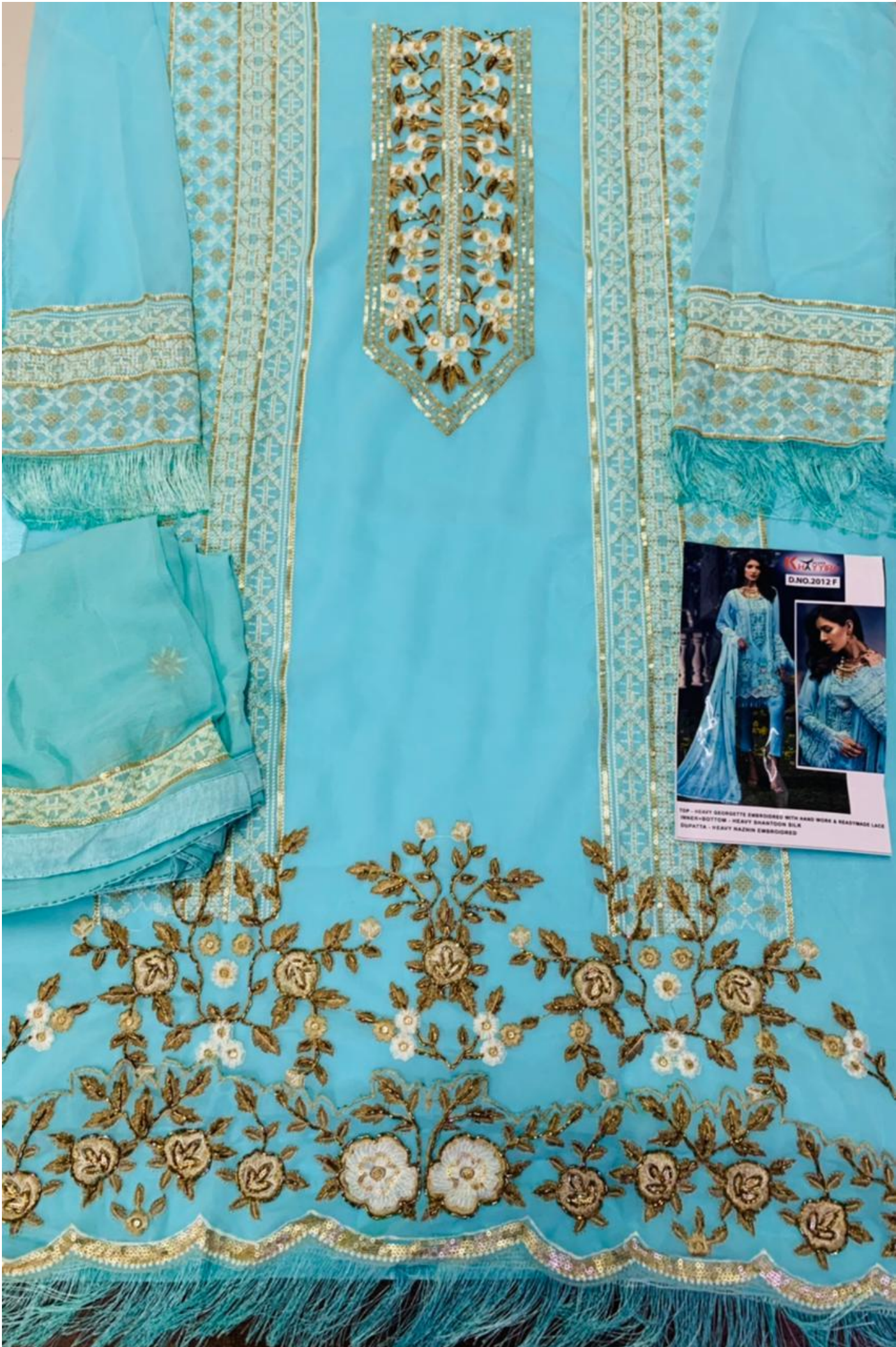
HAUTE D.NO.2012 F TOP - HEAVY GEORGETTE EMBROIDERED WITH HAND MADE A RESHINAGE LACE MIDIA-BOTTOM - HEAVY BRANTOOR SILK DUPATTA - VERY NAZIM EMBROIDERED