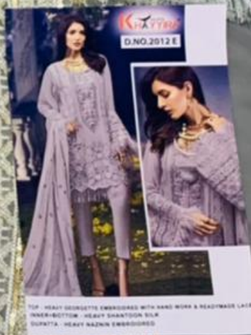
TOP - HEAVY GEORGETTE EMBROIDERED WITH HAND WORK & READYMADE LACE INNER-BOTTOM - HEAVY SHANTOON SILK DUPATTA - HEAVY NAJIN EMBROIDERED