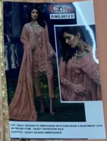
TOP - HEAVY GEOMETRIC EMBROIDERED WITH HAND MADE & READYMADE LACE INSTRUMENTUM - HEAVY SHANTOON SILK DUPATA - HEAVY NAZKIN EMBROIDERED