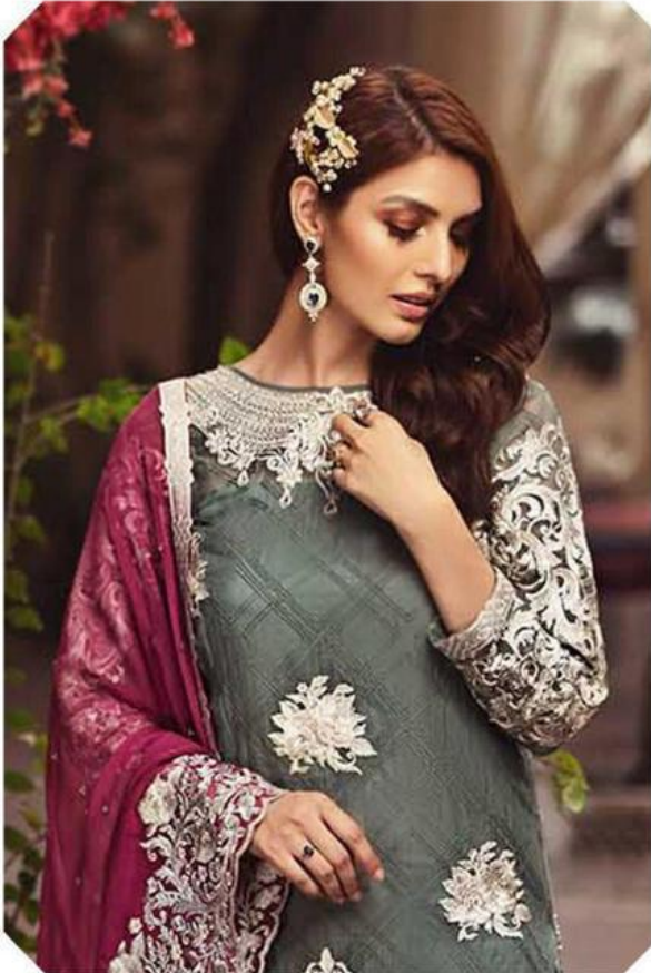
D.NO - 101