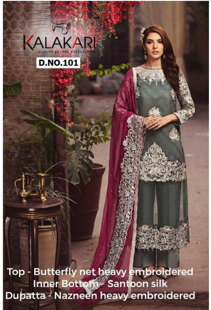
Top - Butterfly net heavy embroidered Inner Bottom - Santoon silk Dupatta - Nazneen heavy embroidered