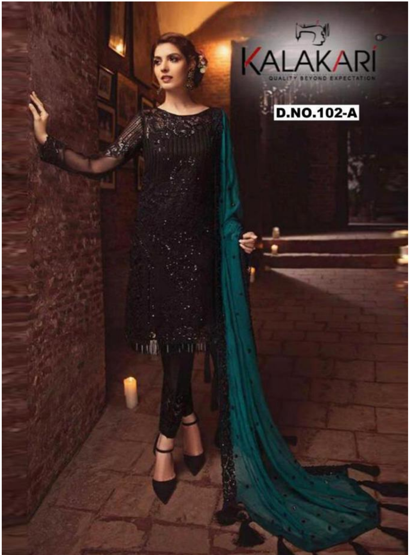
Top - Georgette heavy embroidered Inner Bottom - Santoon silk with emb patch Dupatta - Nazneen heavy embroidered