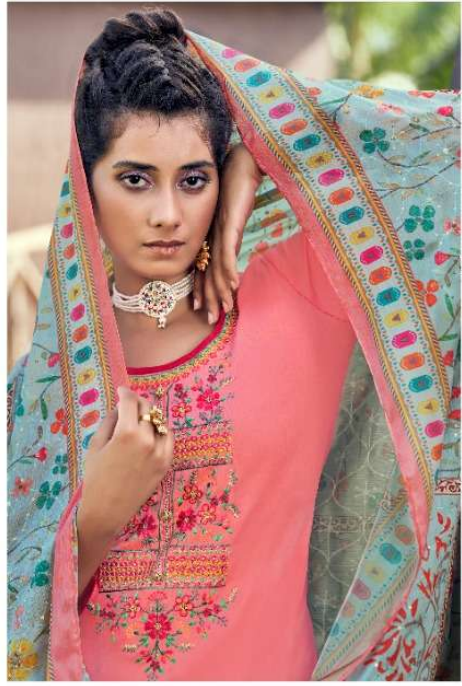
CODE | 705