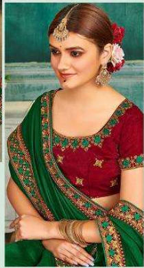
AN ELEGANT RE-INTERPRETATION OF FASHION'S CLASSIC DESIGNS