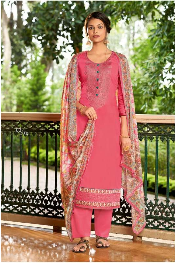
The dynamics of fashion