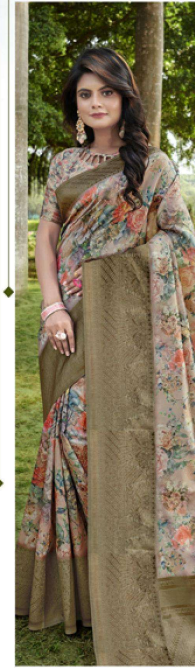
◆ 1005 ◆