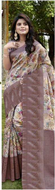
◆ 1002 ◆