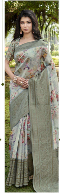
◆ 1006 ◆