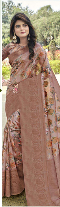
◆ 1003 ◆