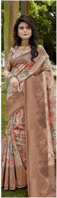
◆ 1001 ◆