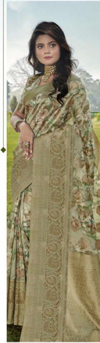
◆ 1004 ◆