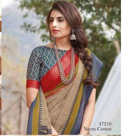
47210 Neem Cotton