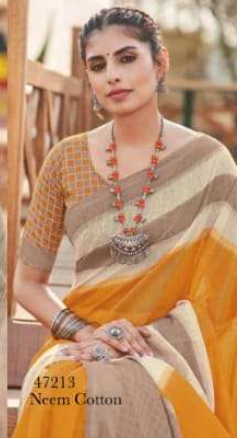
47213 Neem Cotton