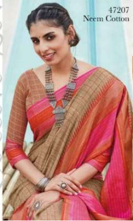
47207 47208 Neem Cotton Neem Cotton