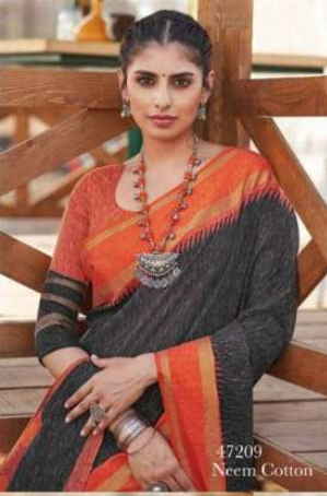
47209 Neem Cotton