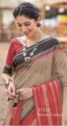
47212 Neem Cotton