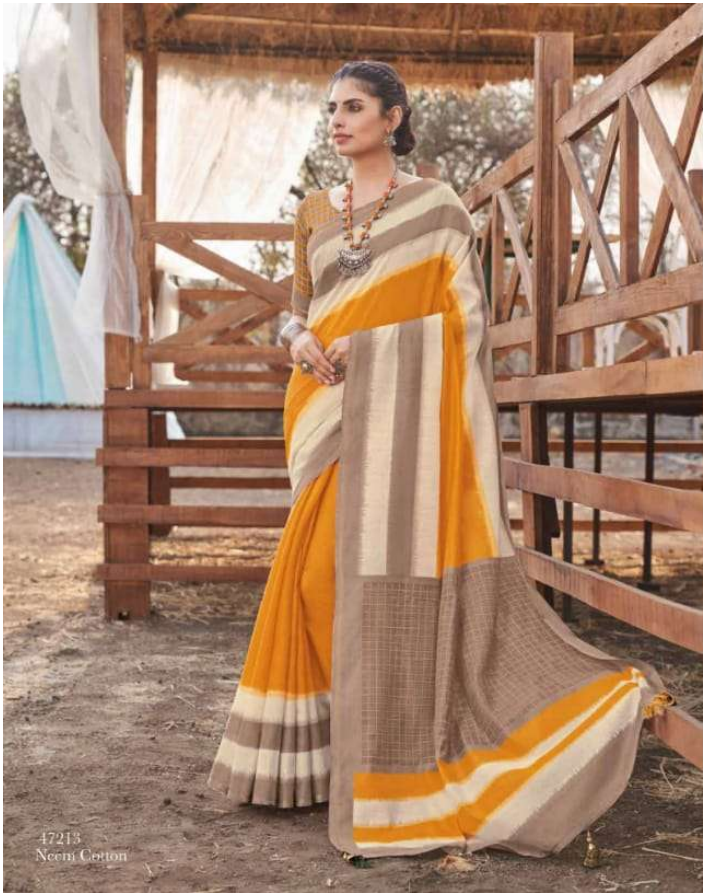
47213 Neemi Cotton