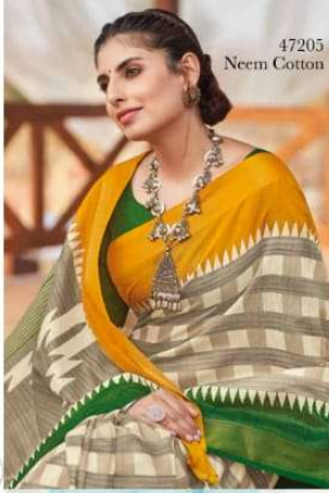
47205 Neem Cotton