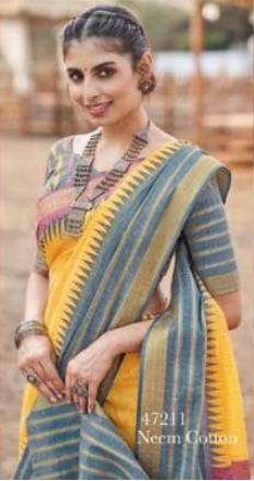
47211 Neem Cotton