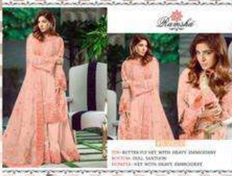
100% BUTTER FLY NET WITH HEAVY EMBROIDERY WITH THE IDEAL SASHION DUPATTA NET WITH HEAVY EMBROIDERY