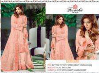
100% BUTTER FLY NET WITH HEAVY EMBROIDERY WITH THE IDEAL SASHION DUPATTA NET WITH HEAVY EMBROIDERY