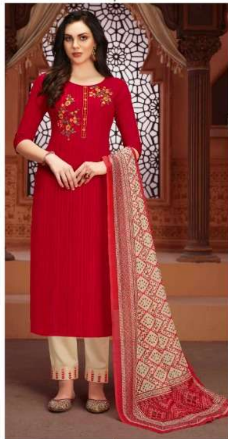
CODE | 7014