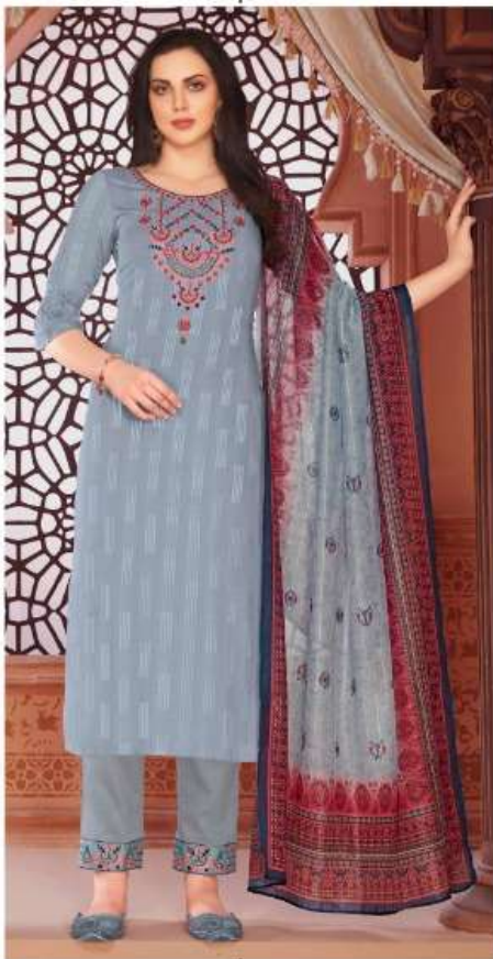
CODE | 7013