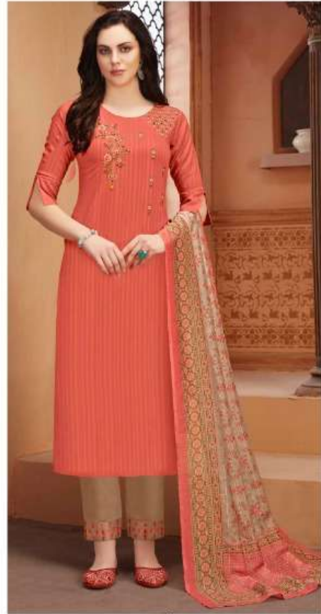
CODE | 7016