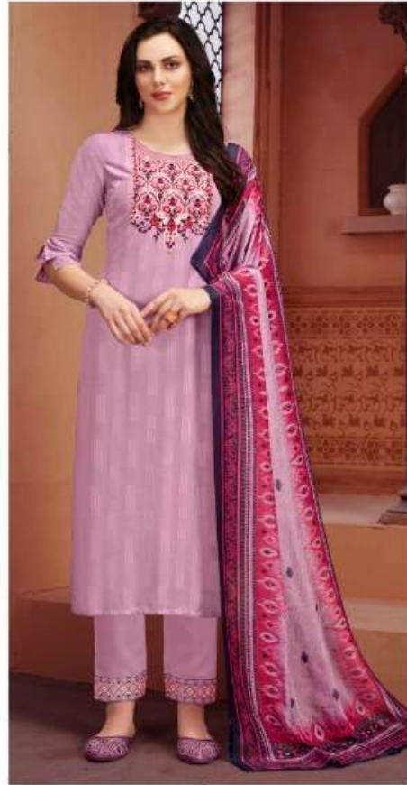
CODE | 7012