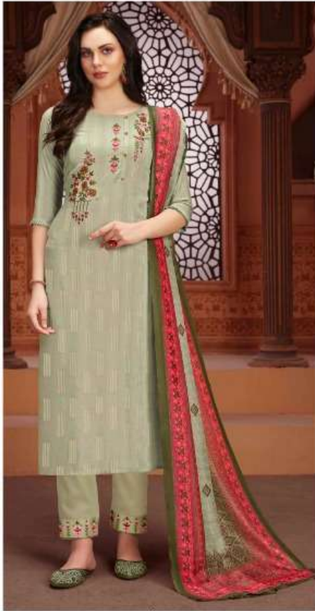
CODE | 7011