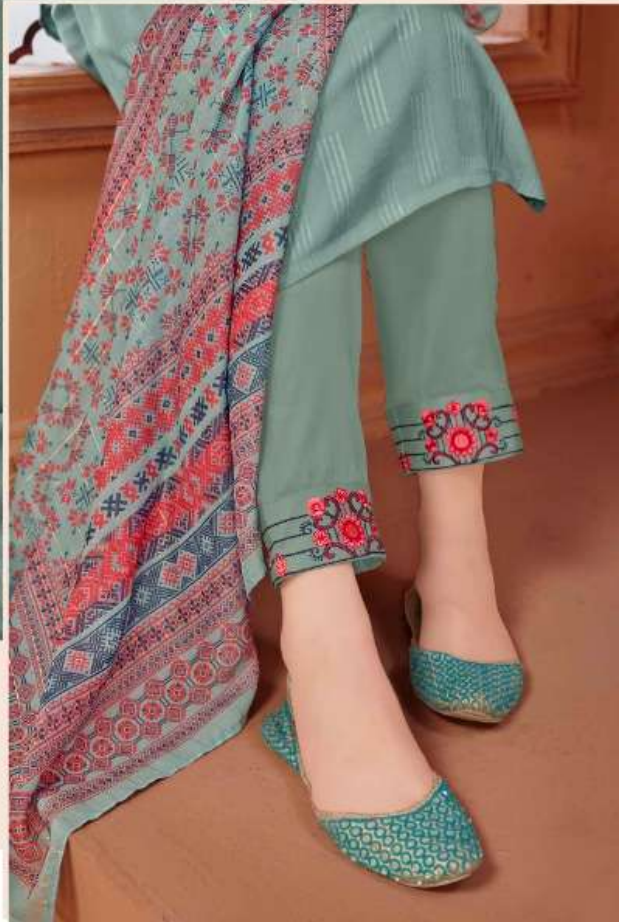
CODE | 7015 Make it simple, but significant