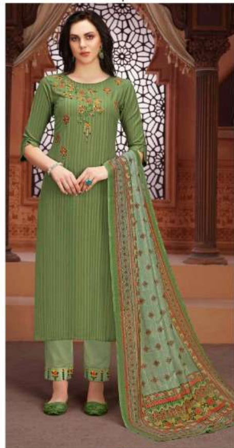
CODE | 7018