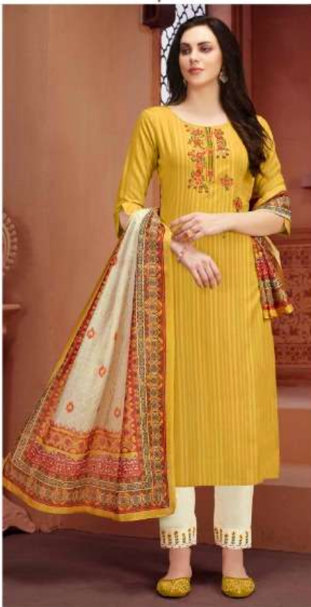
CODE | 7017