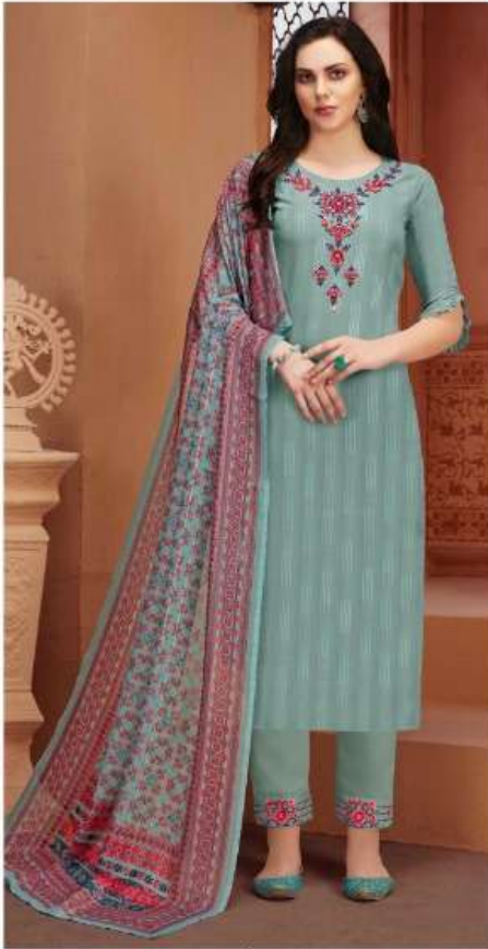
CODE | 7015