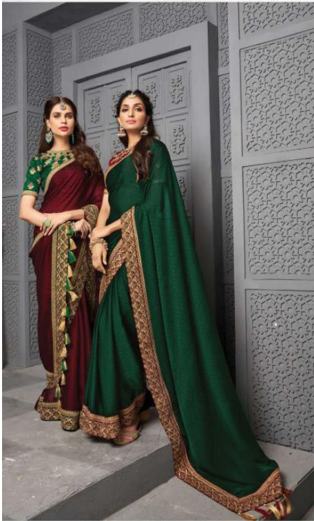
EXHIBIT YOUR STYLE