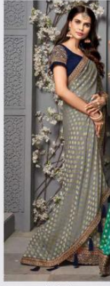
4909 - A