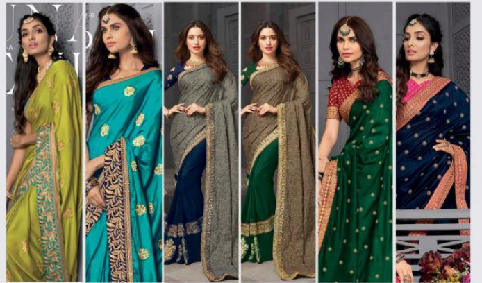
4912 - A 4912 - B 4914 - A 4914 - B 4916 - A 4916 - B