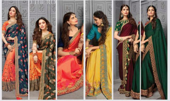
4904 - A 4904 - B 4906 - A 4906 - B 4907 - A 4907 - B