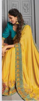
4906 - A