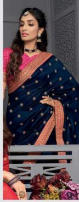
4916 - B