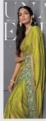
4912 - A