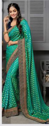
4909 - B