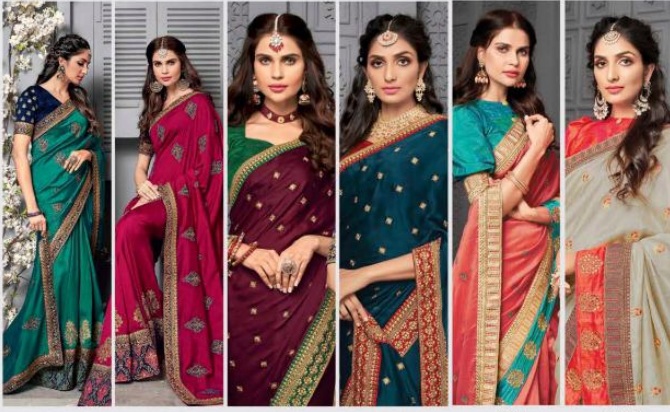
4901 - A 4901 - B 4902 - A 4902 - B 4903 - A 4903 - B