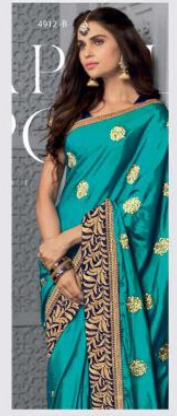
4912 - B