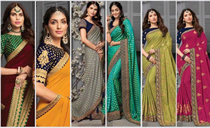
4908 - A 4908 - B 4909 - A 4909 - B 4911 - A 4911 - B