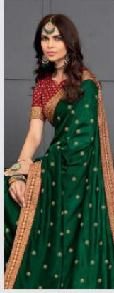
4916 - A