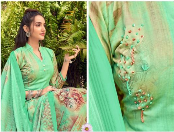
Replace your out-of-date wardrobe with ecologically patterned collection ambal mahi valarigattin valarun janarun baathu to your personality. 16805