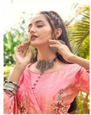
She considers herself fashionable and see luxury brands as necessary components of updating her lifestyle.