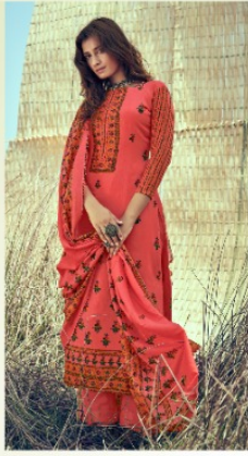
D.NO / 39001 ••