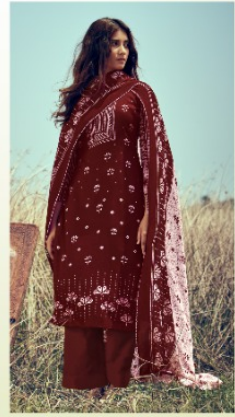
D.NO / 39008 ••