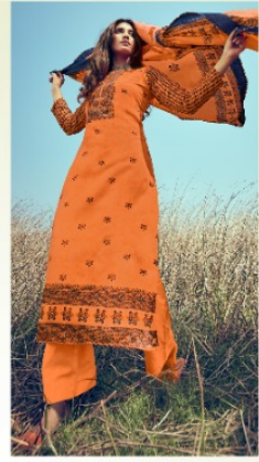
D.NO / 39004 ••