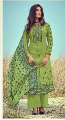
D.NO / 39003 ••