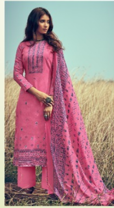
D.NO / 39007 ••