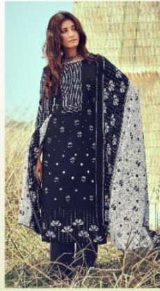
D.NO / 39006 ••