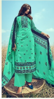
D.NO / 39002 ••