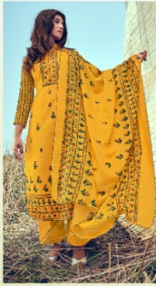
D.NO / 39005 ••