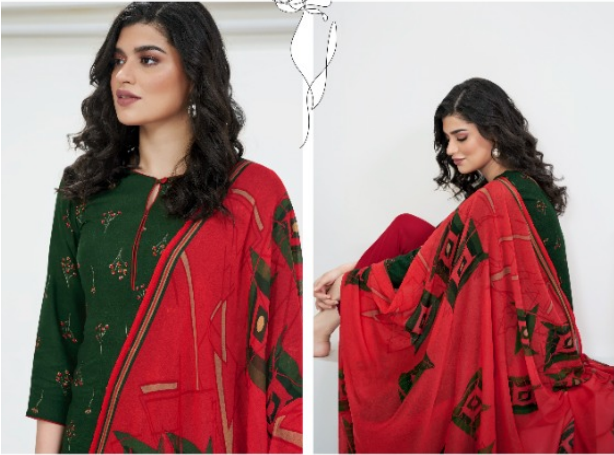
16001 Starting it its self - looking long of them all time - the most long all time - you can feel!