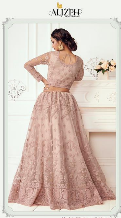
A lovely traditional avatar that has no rival 1005-A