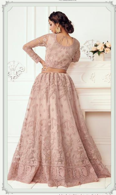
A lovely traditional avatar that has no rival 1005-A