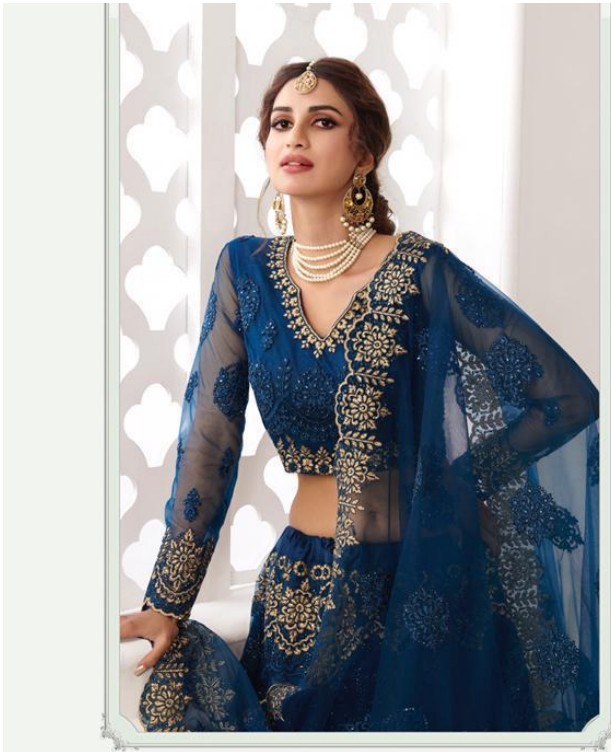
Immerse yourself in unexpected, bright colors & Textures 1007-B