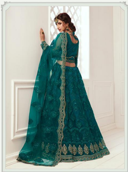
The most interesting fashion trends 1008-C