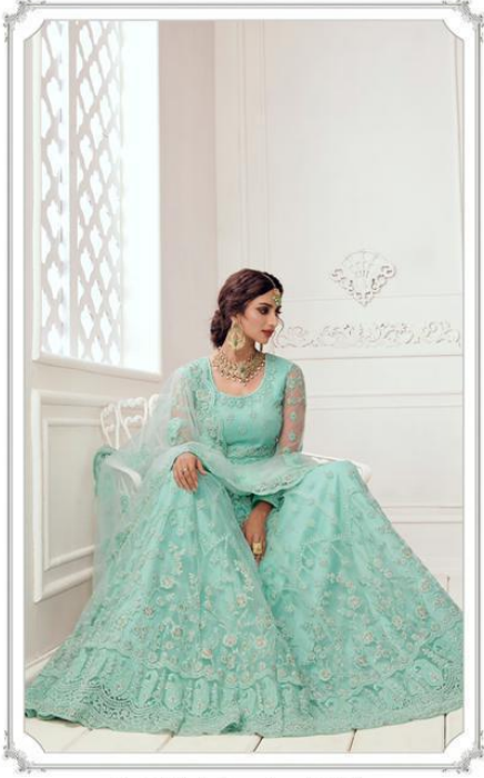
Wearing this lehnga, showcase elegance in its best form 1005-B