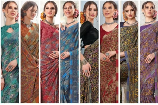
9501A 9501B 9501C 9501D 9502A 9502B 9502C 9502D