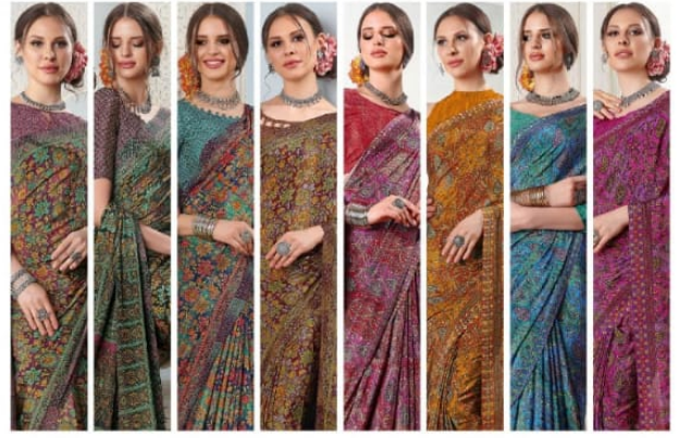
9503A 9503B 9503C 9503D 9504A 9504B 9504C 9504D