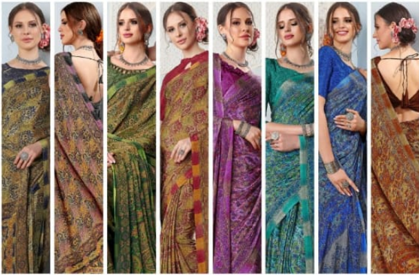
9505A 9505B 9505C 9505D 9506A 9506B 9506C 9506D