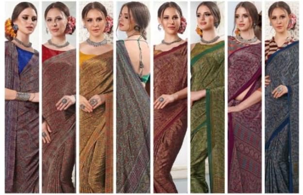
9507A 9507B 9507C 9507D 9508A 9508B 9508C 9508D