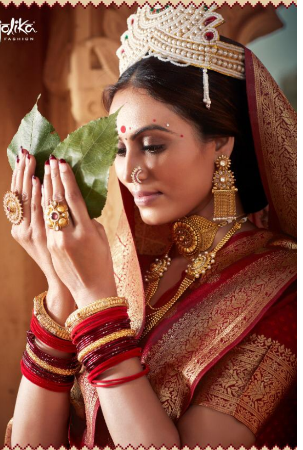
Dream Attire ♦ Step in to your special day with your dream attire that makes an entrance feel for the joy of your event with the divine... nothing more by RITVI,OTV 3888 *GST*