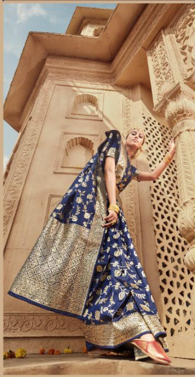
Fresh Vibrancy ♦ This collection brings heritage designs with the fresh vibrancy and sense of modern life.