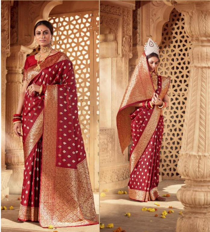
Dream Attire ♦ Step in to your special day with your dream attire that makes an entrance feel for the joy of your event with the divine... calling them by RITVI,OTV