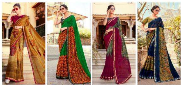
DESIGN-1509 DESIGN-1510 DESIGN-1511 DESIGN-1512