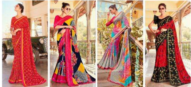
DESIGN-1505 DESIGN-1506 DESIGN-1507 DESIGN-1508