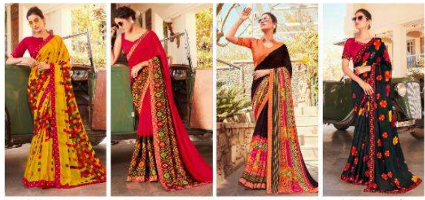
DESIGN-1501 DESIGN-1502 DESIGN-1503 DESIGN-1504