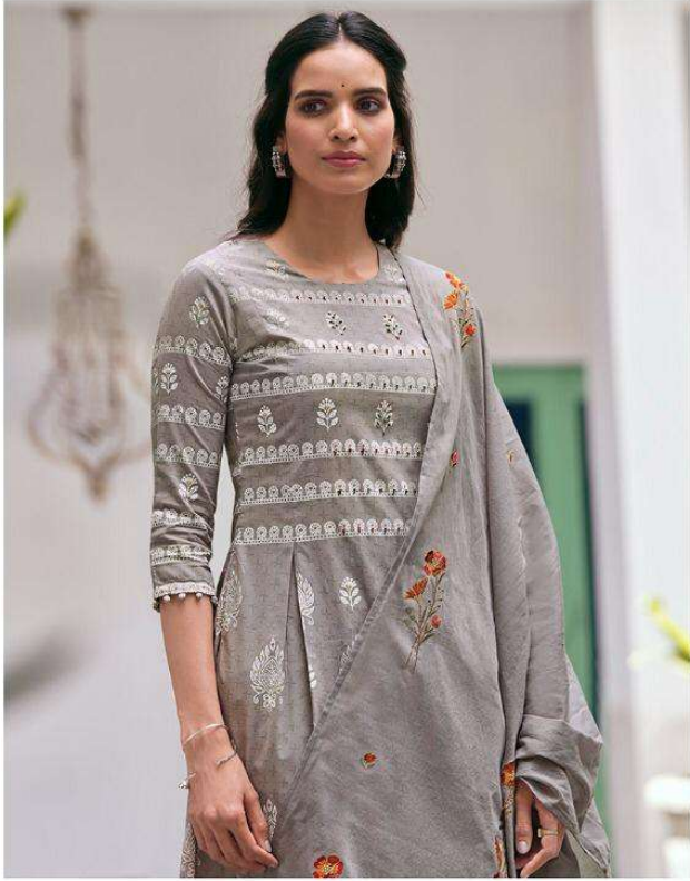
Patterns & prints to blend into a easy draped silhouette in soft sensual fabrics.