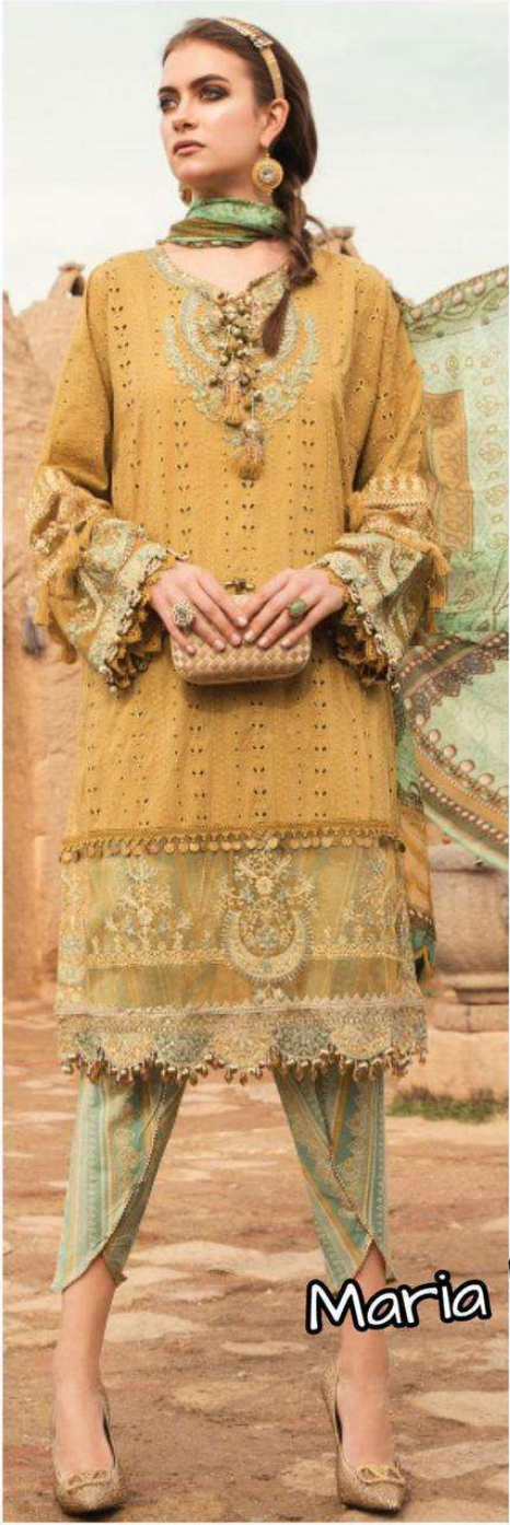
Maria b lawn