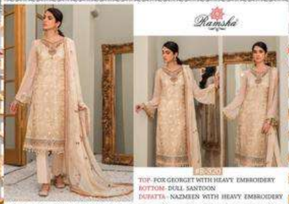
TOP- FOX GEORGET WITH HEAVY EMBROIDERY BOTTOM- DULL SANTOON DUPATTA- NAZMEEN WITH HEAVY EMBROIDERY