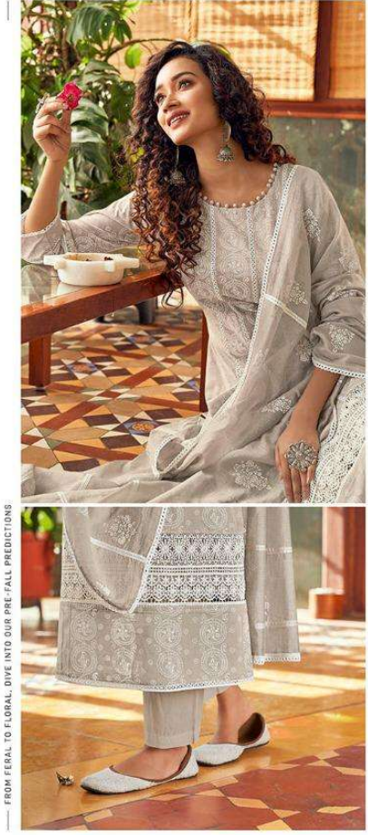
FROM FERAL TO FLORAL. DIVE INTO OUR PRE-FALL PREDICTIONS