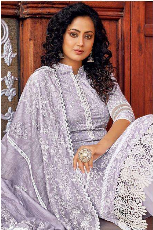
SALUTE YOUR FLORAL LOVE WITH THIS ELEGANT AND CLASSY PIECE WHILE YOU CHECK OUT THIS LOOK BOOK.