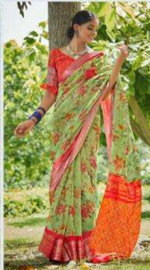
O.S -203 »»