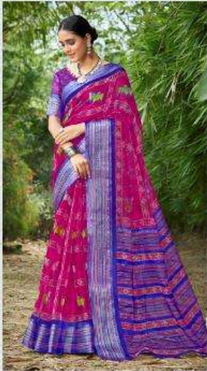
O.S -197 »»