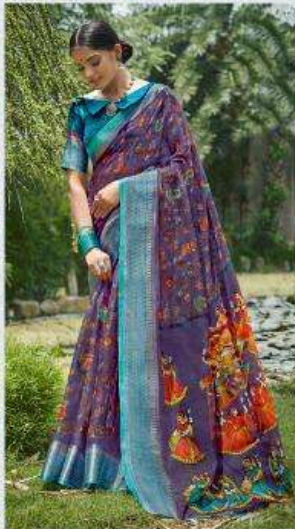
O.S -202 »»