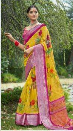
O.S -193 »»