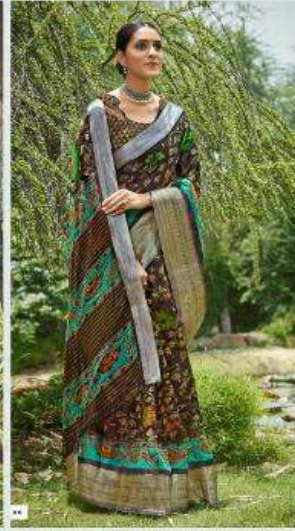
O.S -196 »»