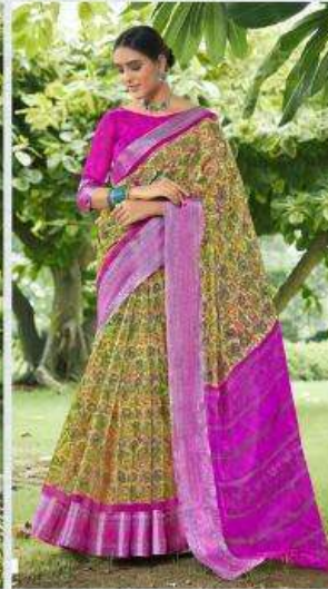
O.S -200 »»