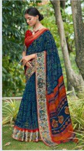
O.S -195 »»