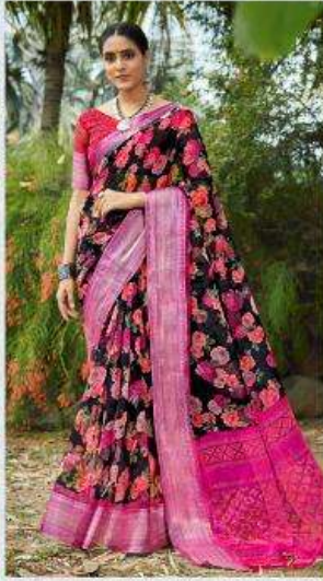
O.S -194 »»