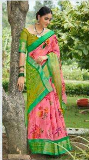
O.S -199 »»