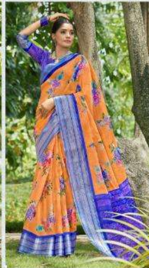
O.S -204 »»