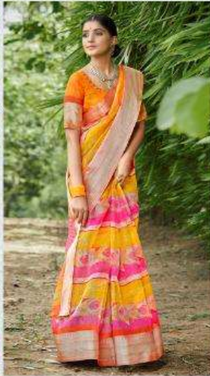
O.S -198 »»