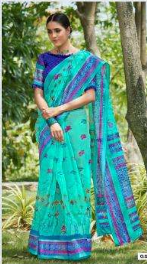
O.S -201 »»