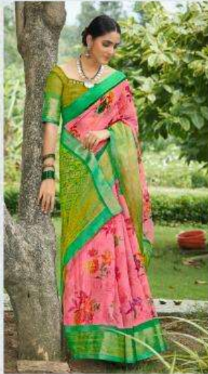
O.S -199 »»