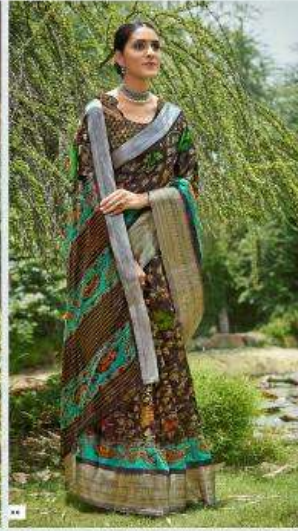
O.S -196 »»