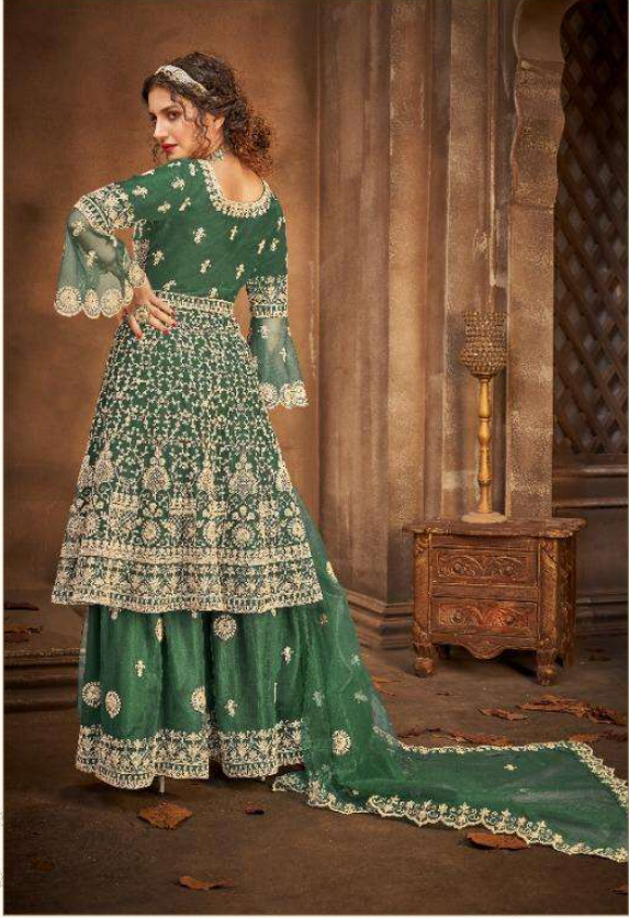
Sensible and classic portrait of the saris and all the various other dresses...