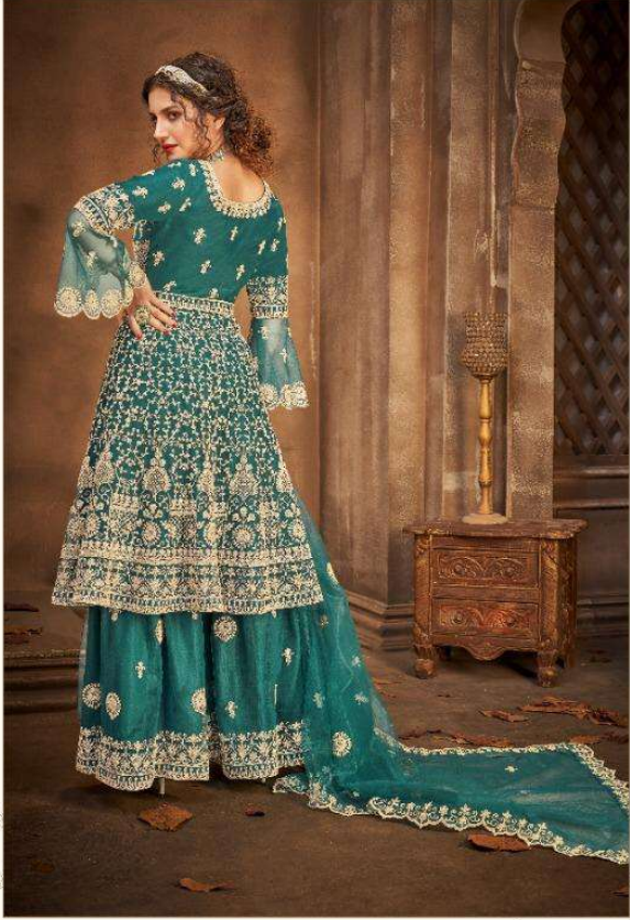
Sensible and classic portrait of the saris and all the various other dresses...