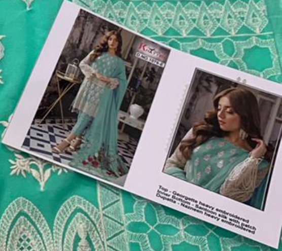
Top - Georgette heavy embroidered Sleeve - Same as top with patch Dupatta - Nazreen heavy embroidered