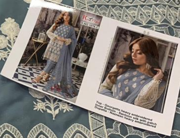
Top - Georgette heavy embroidered (new Bottom - Santon silk with patch Dupatta - Nazneen heavy embroidered