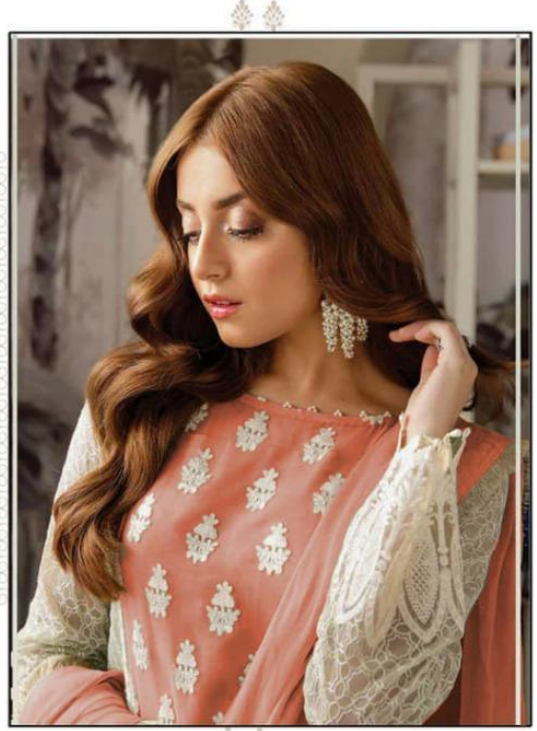
Top - Georgette heavy embroidered Inner Bottom - Santoon silk with patch Dupatta - Nazneen heavy embroidered