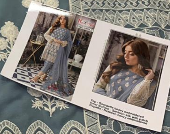
Top - Georgette heavy embroidered (new Bottom - Santon silk with patch Dupatta - Nazneen heavy embroidered)