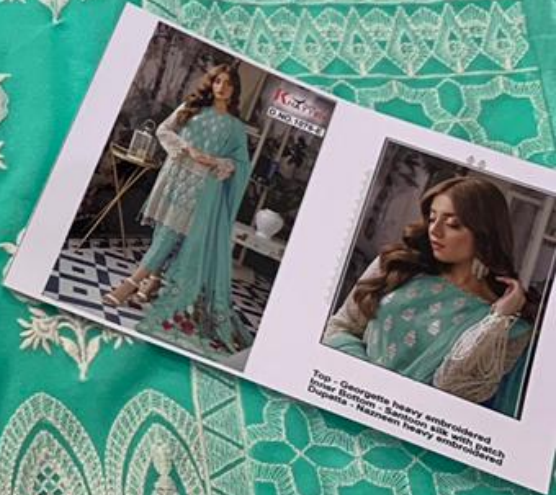
Top - Georgette heavy embroidered Sleeve - Same as top with patch Dupatta - Nazreen heavy embroidered