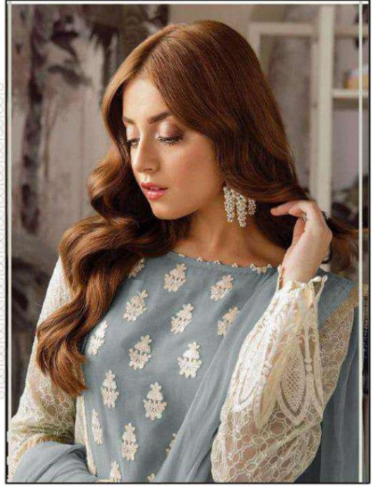
Top - Georgette heavy embroidered Inner Bottom - Santoon silk with patch Dupatta - Nazneen heavy embroidered