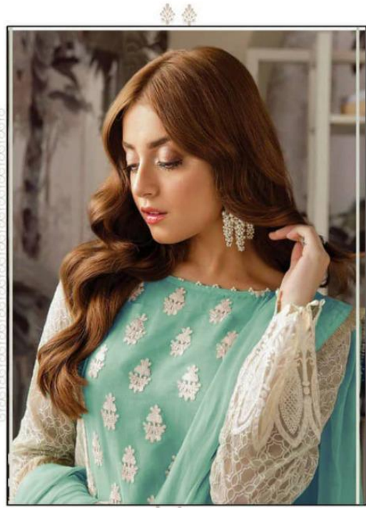
Top - Georgette heavy embroidered Inner Bottom - Santoon silk with patch Dupatta - Nazneen heavy embroidered