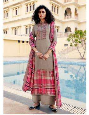
# 15908 ●●●●