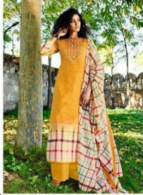
# 15906 ●●●●