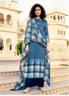
# 15901 ●●●●