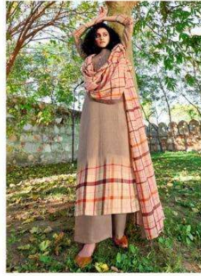
# 15903 ●●●●