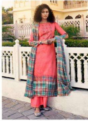
# 15902 ●●●●