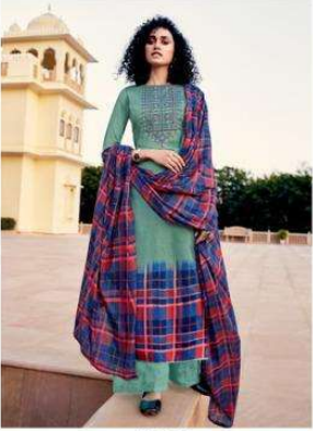
# 15905 ●●●●