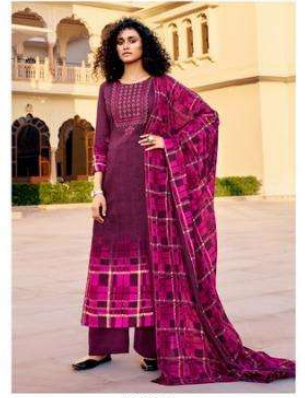
# 15904 ●●●●