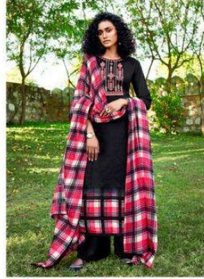
# 15907 ●●●●