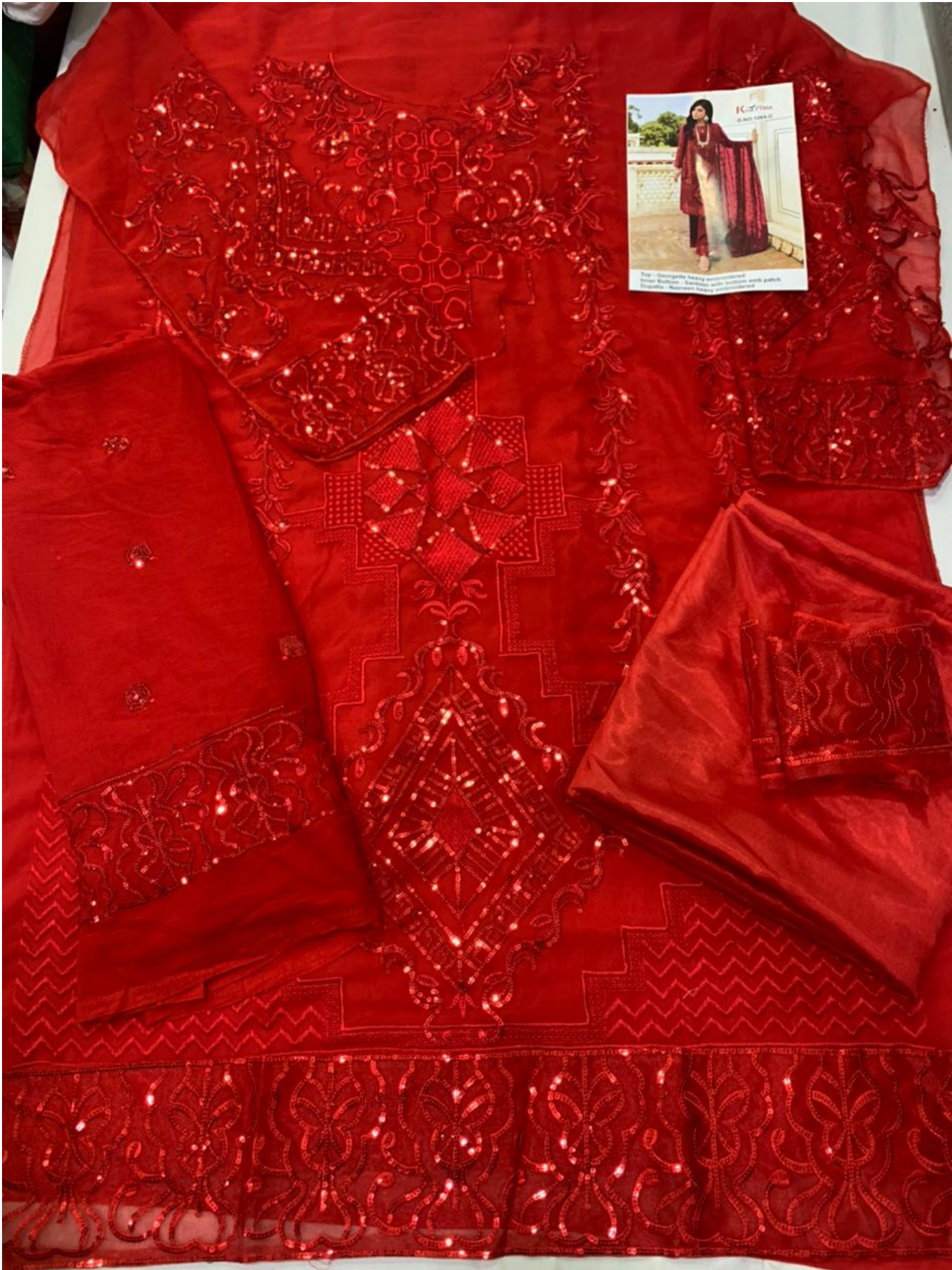
Kurti Dress Top - Georgette fabric embroidered with sequins. Skirt - Georgette with patches Dress - Net with sequins