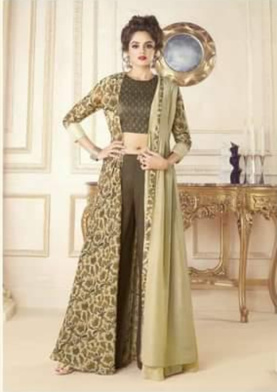
◀ D.no. 5707 ▶