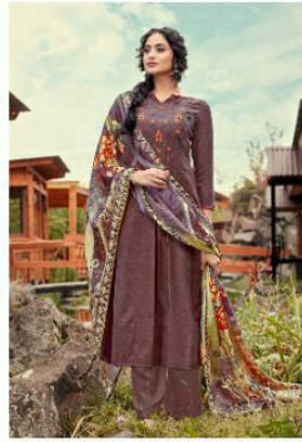
CODE # 1003