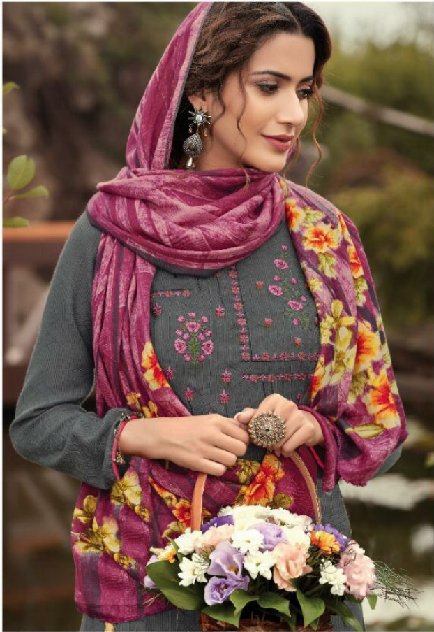
Now the style for women with true colors dress with eye-catching theme & dazzling designs.