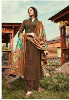
CODE # 1002