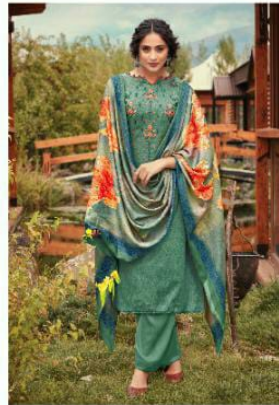
CODE # 1007