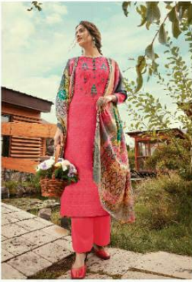
CODE # 1001