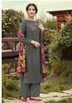
CODE # 1006