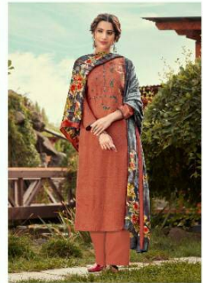
CODE # 1008