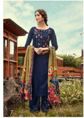
CODE # 1004