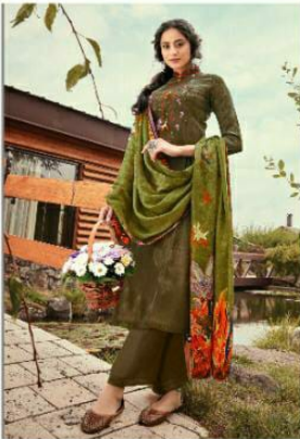
CODE # 1005