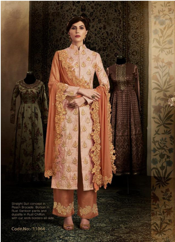
Straight Suit concept in Peach Brocade. Bottom in Rust Santoon pants and dupatta in Rust Chiffon with cut work borders all side.