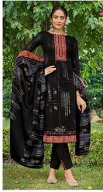
---NUR | 2006---