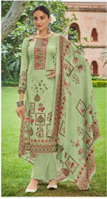
---NUR | 2004---