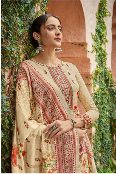
...NUR | 2009...