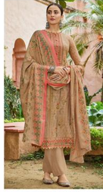
---NUR | 2007---