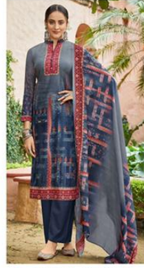
---NUR | 2008---