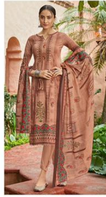
---NUR | 2010---

ہاؤس آف لائن HOUSE OF LAWN® DEFINING FEMININITY AND LUXURY