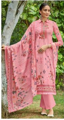
---NUR | 2005---