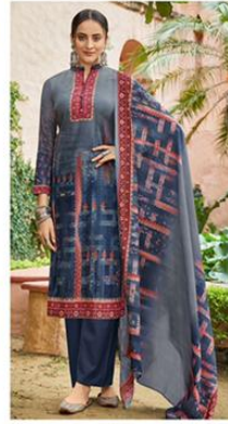
---NUR | 2008---