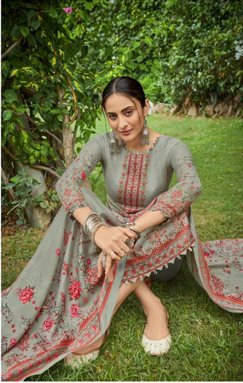
---NUR | 2003---