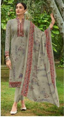
---NUR | 2001---