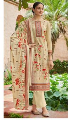
---NUR | 2009---