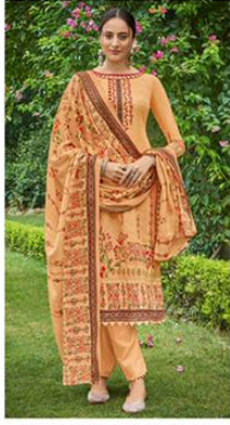
---NUR | 2002---