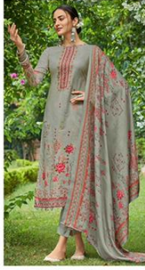
---NUR | 2003---