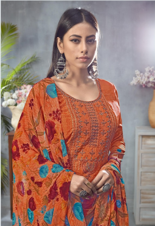
Enriched with remarkable designs, each piece from this line-up is an ethereal delight.