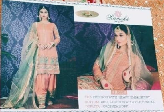
TOP - CHINON WITH HEAVY EMBROIDERY BOTTOM - DULL SANTOON WITH PEACH WORK DUPATTA - ORGENZA WORK