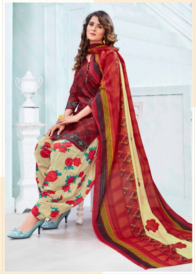
Enjoy the spectacular print on gripping colour that brings charisma to your personality