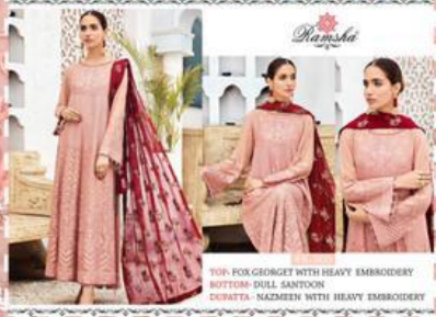
TOP: FOX GEORGET WITH HEAVY EMBROIDERY BOTTOM: DULI SANTOOK DUPATTA: NAZMEEN WITH HEAVY EMBROIDERY