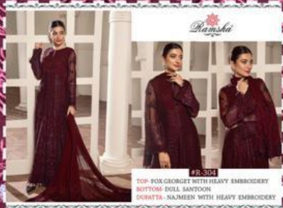
FR-304 TOP: FOX GEORGET WITH HEAVY EMBROIDERY BOTTOM: DILL SANDOON DUPATTA: NAMREEN WITH HEAVY EMBROIDERY